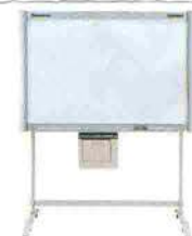
UB-5325 2-Screen Standard size