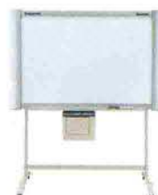
UB-7325 4-Screen Standard size (Stand option)

*1 Screen can also be used for the Projector.