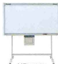
UB-5825 2-Screen Wide size